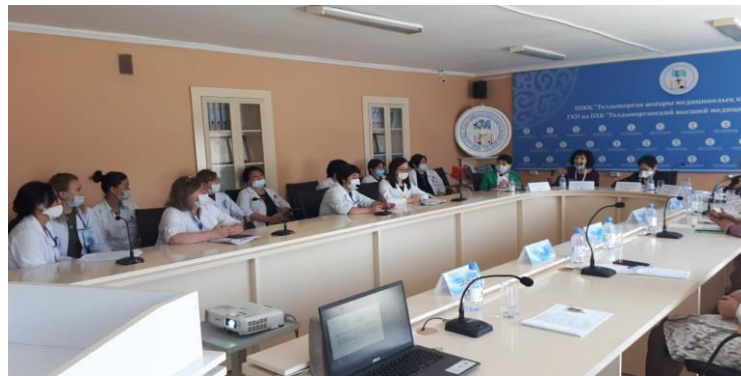
Photo 3. EEC conducts an interview with the chairmen of the CEP and the heads of the offices.

Members of the EEC visited the test center, museum, dormitory "House of Students" of the college, canteen, first-aid post, sports complex, assembly hall. The information support department, consisting of three computer classes, was examined (84 computers, 97 laptops, 5 tablets connected to the Internet and 2 projectors are involved in the educational process).