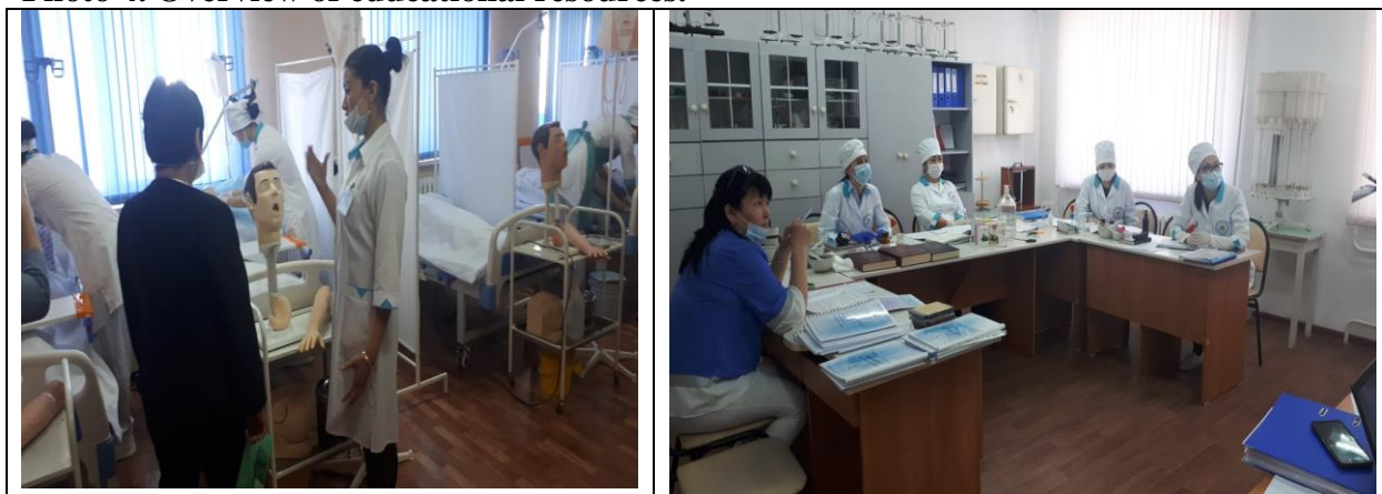
Photo 4. Overview of educational resources.

This interview and study of the documentation allowed the experts to validate the data in the self-assessment report against the standard 2,4,5.