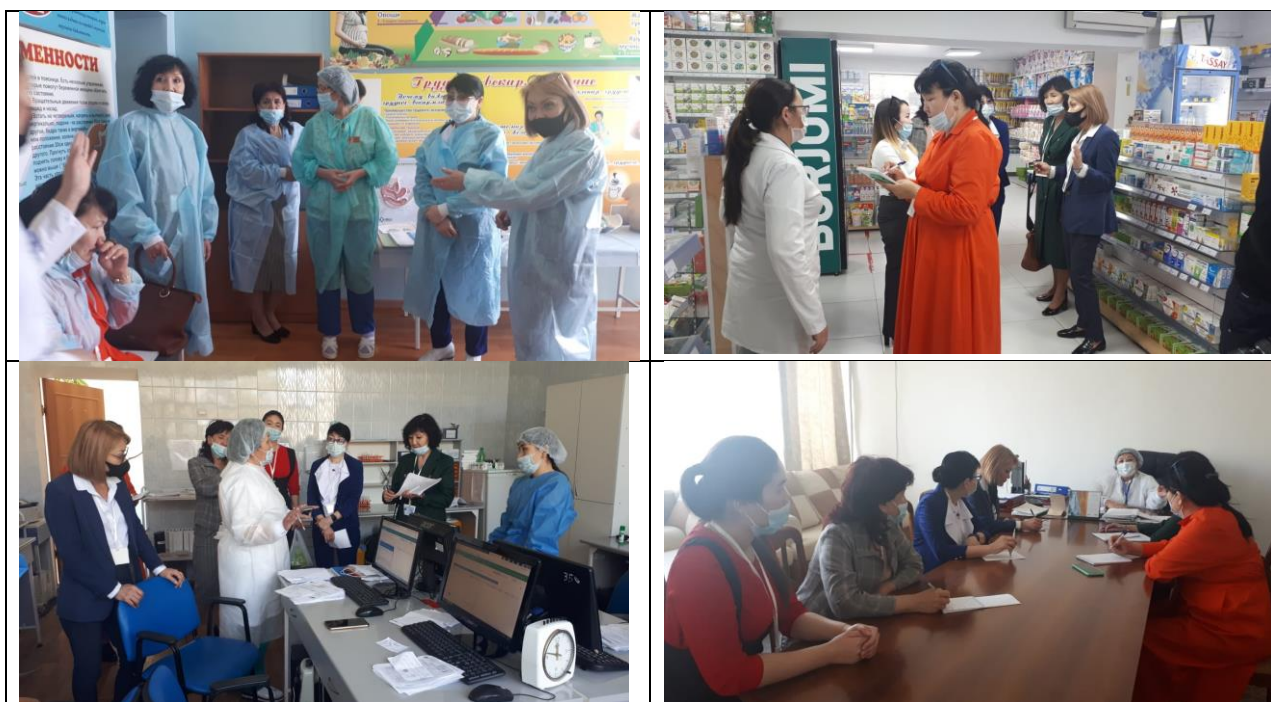
Photo 7. Visiting EEC clinical sites.

According to the programme, members of the EEC prodDemonstrated the Paragraph Bilim information and educational platform used for distance learning: an electronic journal, timetable, statements, lists of groups, etc.