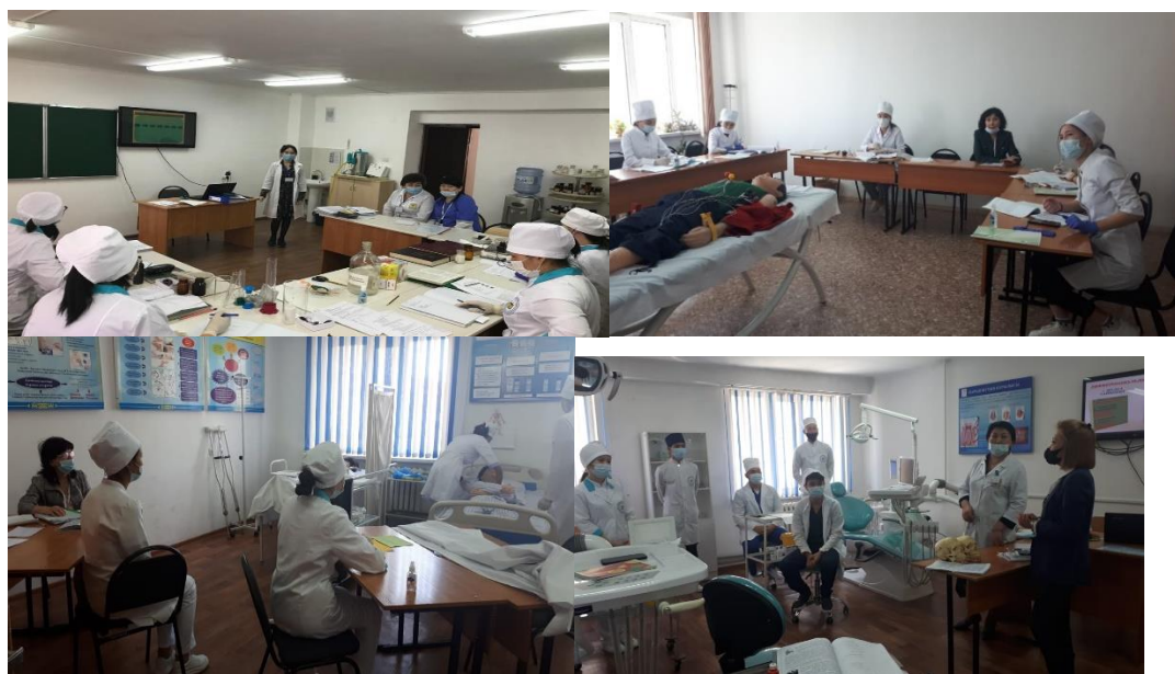
Photo 8. Visiting EEC practical training.

All attended classes are provided with a working curriculum, control and measuring instruments, demonstration and handouts, equipment for individual practicing skills.